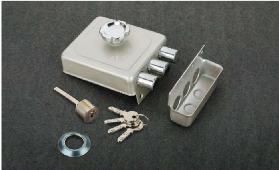
RS 001 | TRIE BOLT