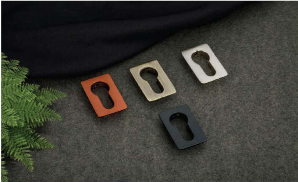
Small Key Hole

Finish : Z Black, Antique, Chrome, Satin, S.S. Matt PVD : Rose Gold, Gold