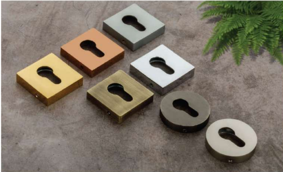
Square / Round Key Hole

Finish : Z Black, Antique, Chrome, Satin, S.S. Matt PVD : Rose Gold, Gold