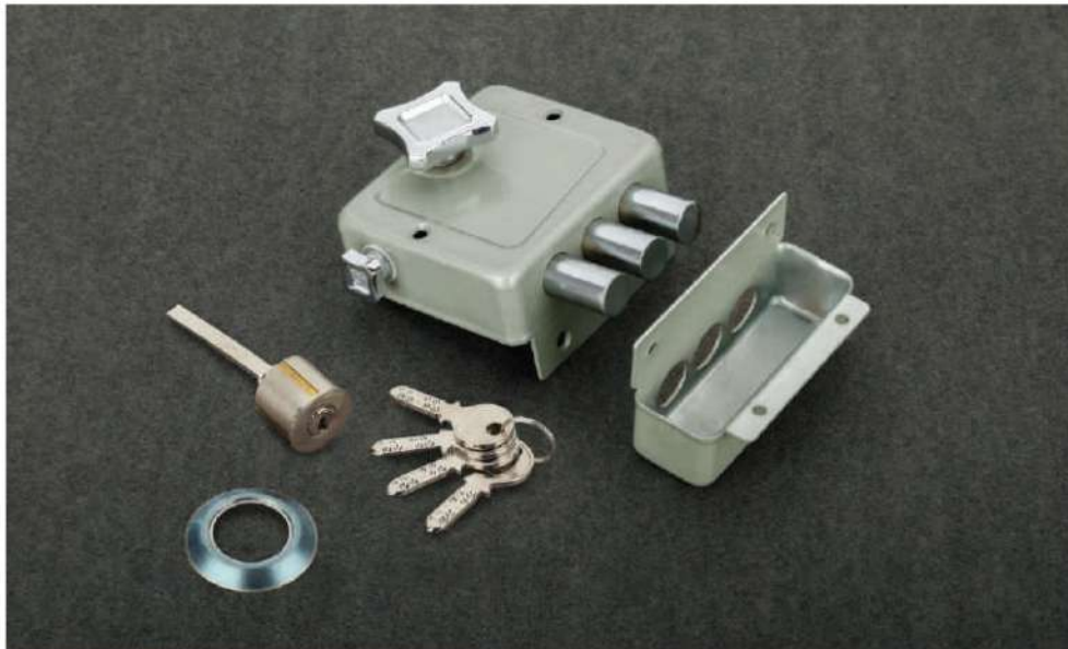
RS 002 | TRIE DAED LOCK