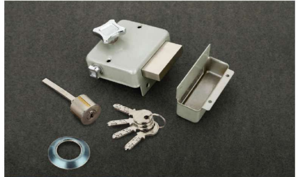
RS 003 | DEAD LOCK