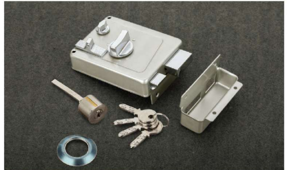
RS 004 | NIGHT LATCH